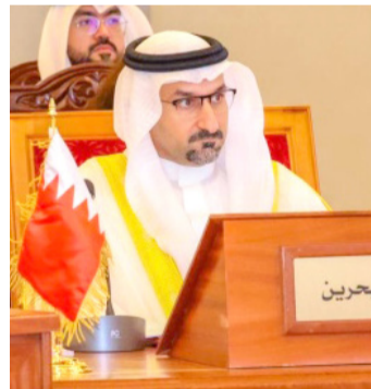
Mr. Fakhro heads Bahrain's delegation at the event

The meeting was also attended by Nigel Huddleston, UK Minister of State for International Trade.