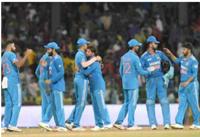
India's team celebrates the win against Sri Lanka