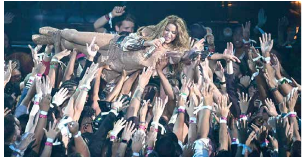
Colombian singer Shakira performs on stage during the MTV Video Music Awards