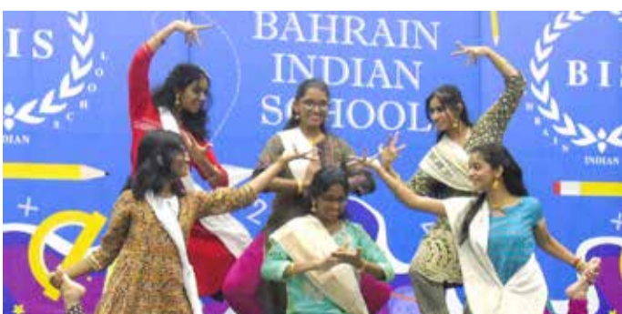
Students perform a dance as part of the celebration

Students also presented a special assembly wherein they presented panorama of poems showcasing the hopes and emo-