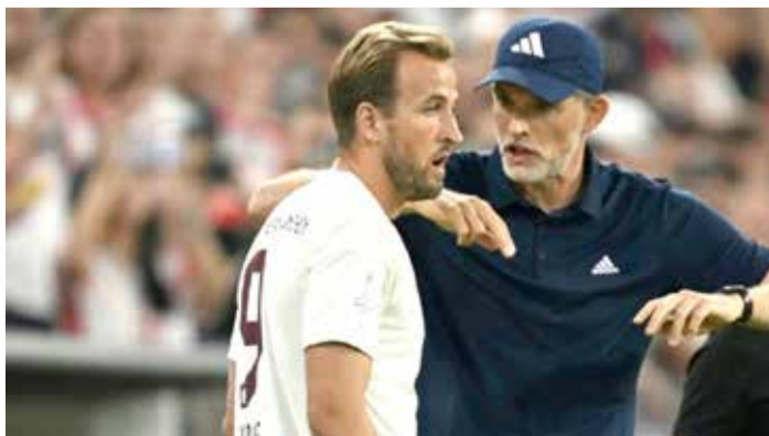
Bayern Munich's English forward #09 Harry Kane is exchanged by Bayern Munich's German head coach Thomas Tuchel

"At this time we're trying to get him more involved in our