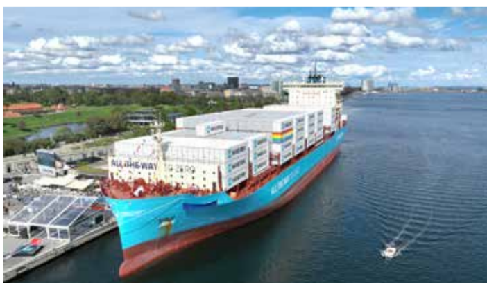
This aerial view shows the world's first methanol-enabled container vessel called "Laura Maersk" of A.P. Moller-Maersk after its namegiving ceremony in Copenhagen.

"Green methanol is our fuel of choice ... because it is the only scalable solution that can meet