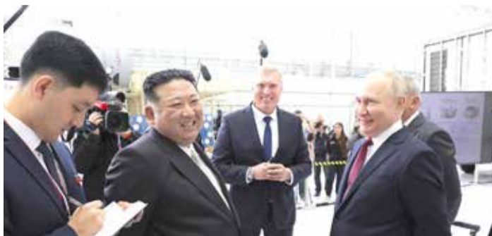
North Korea's leader Kim Jong Un (2nd L) and Russia's President Vladimir Putin (R) visiting the Vostochny Cosmodrome in Russia's Amur region

Putin also gifted the North Korean leader a "glove from a space suit that has been to space