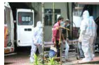
Health workers wearing protective gear shift people who have been in contact with a person infected with the Nipah virus to an isolation center at a government hospital in Kozhikode

India has curbed public gatherings and shut some schools in the southern state of Kerala after two people died of Nipah, a virus from bats or pigs that causes deadly fever, officials said Thursday.