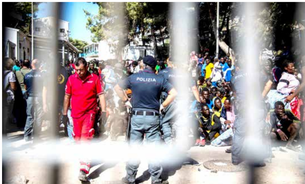
Migrants gather outside the operational center called "Hotspot" on the Italian island of Lampedusa yesterday. The tiny Italian island of Lampedusa struggled to cope with a surge in migrant boats from North Africa after numbers peaked at 7,000 people - equivalent to the entire local population. (AFP)