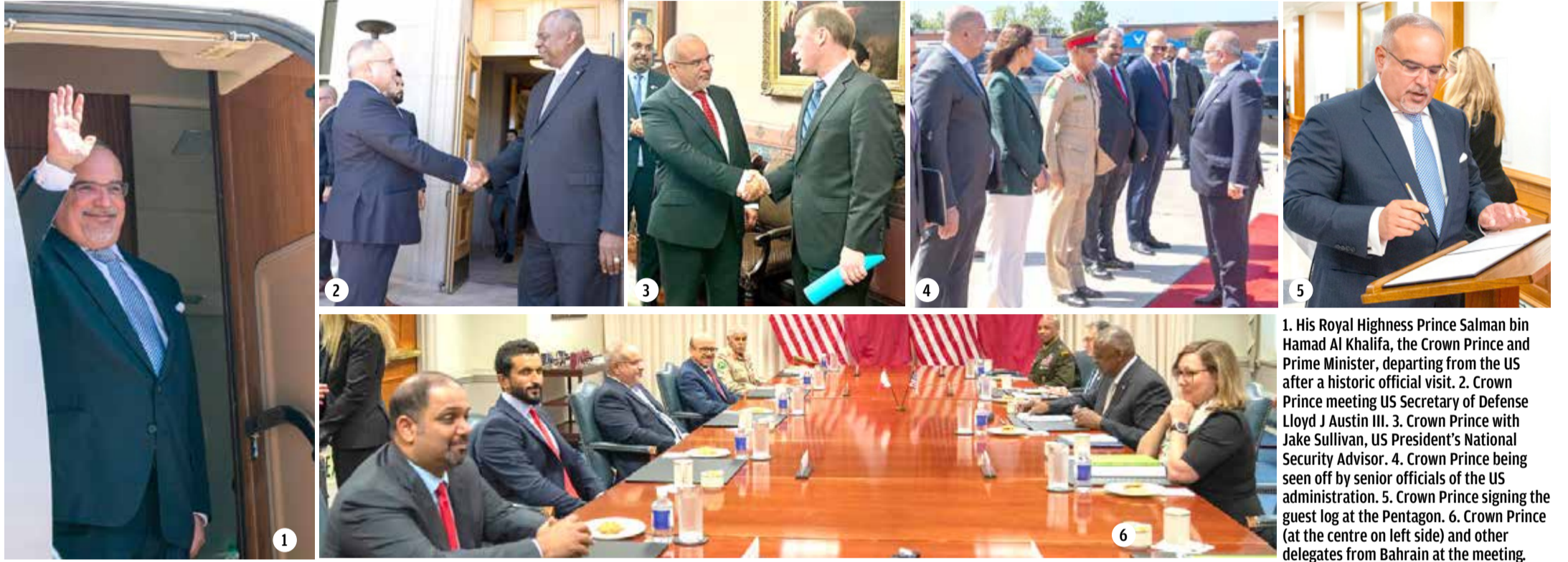
1. His Royal Highness Prince Salman bin Hamad Al Khalifa, the Crown Prince and Prime Minister, departing from the US after a historic official visit. 2. Crown Prince meeting US Secretary of Defense Lloyd J Austin III. 3. Crown Prince with Jake Sullivan, US President's National Security Advisor. 4. Crown Prince being seen off by senior officials of the US administration. 5. Crown Prince signing the guest log at the Pentagon. 6. Crown Prince (at the centre on left side) and other delegates from Bahrain at the meeting.