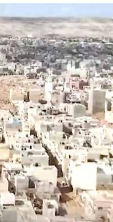
al view of a extensive damage in the wake

testimony published by the Benghazi Medical Center.