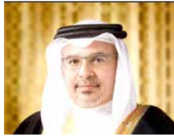
HRH Prince Salman

comprehensive development process to boost parliamentary and political participation.