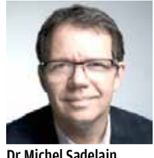
Dr Michel Sadelain

When Michel Sadelain began his decades-long quest to genetically modify immune cells to fight cancer, his peers dismissed his ideas as absurd and even his mother grew concerned for his career. On Thursday, the French and Canadian scientist was announced as a winner of the pres-