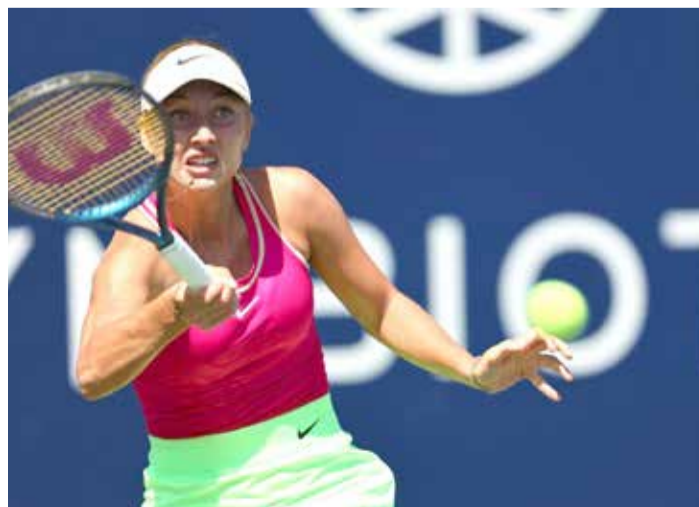
Anastasia Potapova plays a forehand in the first set against Ons Jabeur

"She is truly one of the best in the world and with her style it's