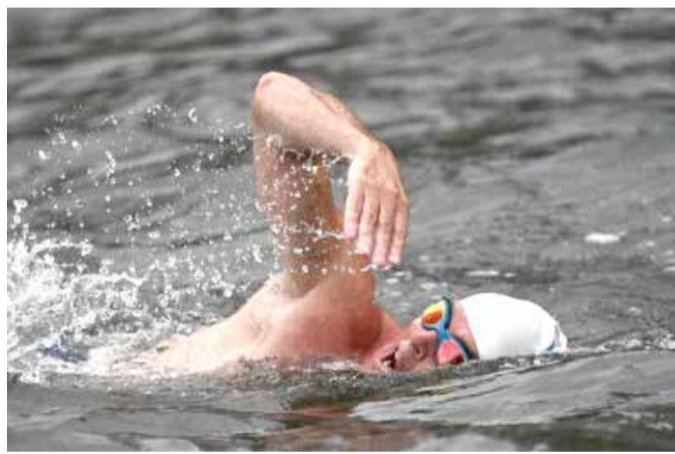
Lewis Pugh arrives at the finish of his 315-mile Hudson River swim in New York