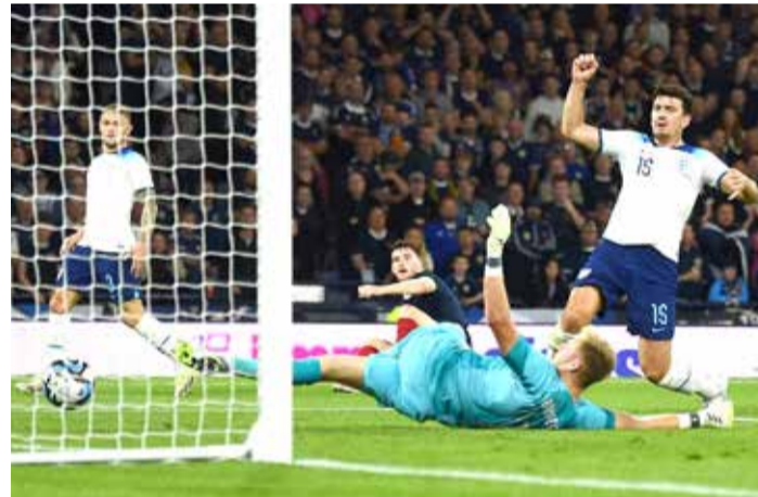
Scotland's defender Andrew Robertson (C) celebrates as England's defender Harry Maguire (R) reacts after scoring an own goal

"I have been through a lot in the last couple of years and I