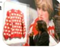
Princess Diana's 'Black Sheep' sweater sells at auction for $1.1 mn

◆ An iconic red sweater worn by Princess Diana shortly after her engagement to then-Prince Charles, featuring rows of fluffy little sheep, sold at auction for more than $1.1 million following a frenetic bout of final bidding. Sotheby's announced yesterday. The 19-year-old sported the knit garment -- which includes one black sheep amid dozens of otherwise white woolly creatures -- at a June 1981 polo match during her whirlwind days as a shy royal-in-the-making. The playfully patterned "Black Sheep" sweater became one of the most emblematic articles of clothing worn by Diana, which in hindsight seems to foretell her troubled journey as a member of the British royal family.