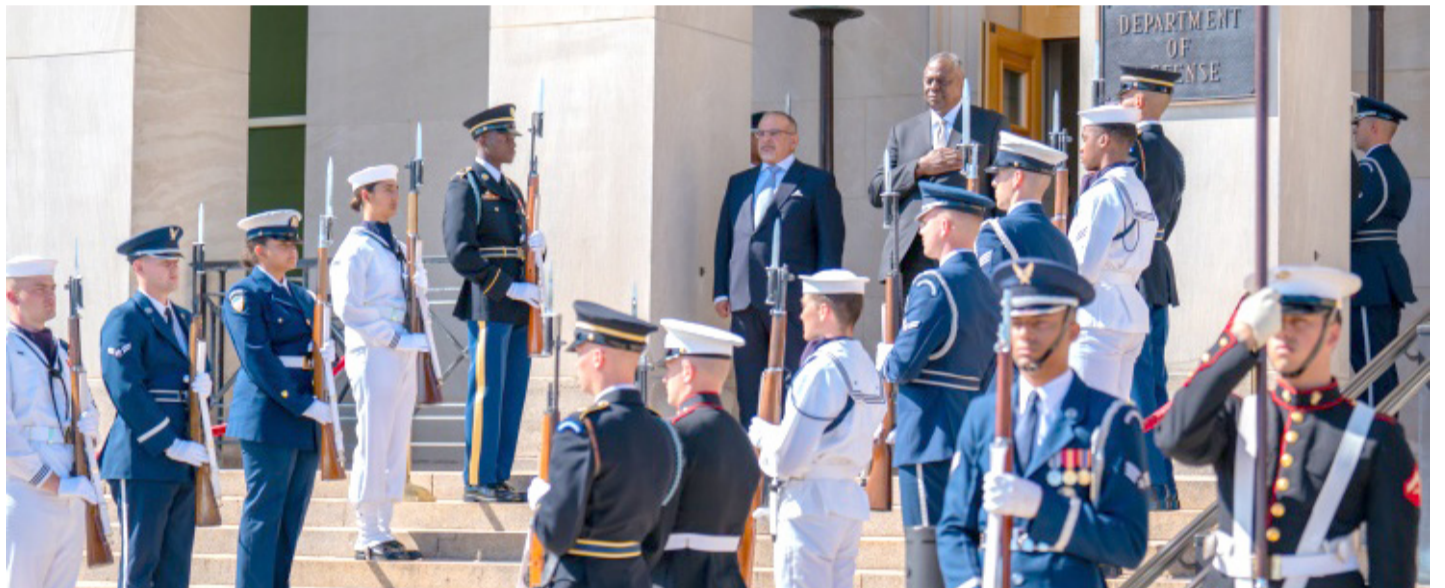
His Royal Highness with the US Secretary of Defense

They praised the signing of the new Comprehensive Security Integration and Prosperity Agreement, which will serve as a cornerstone for cooperation among a broader group of countries that share mutual interests and a common vision with regard to deterrence, diplomacy, and escalation.