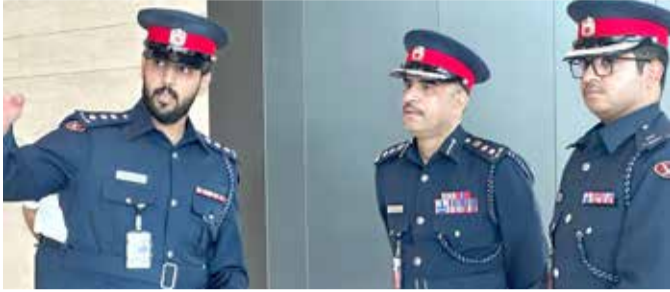
Security officials monitor the practical drills TDT | Manama

Bahrain International Airport Police Directorate, in collaboration with the Bahrain Airport Company (BAC), recently conducted a virtual exercise at the airport premises.