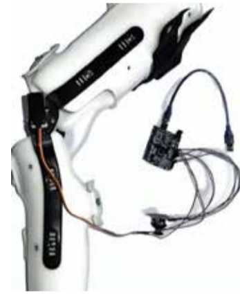
The specialised walking robot project

ments such as battery integration, motion sensors for customisation, Internet of Things (IoT) technology, artificial intelligence (AI), enhanced portability, and extended battery life. These improvements have the