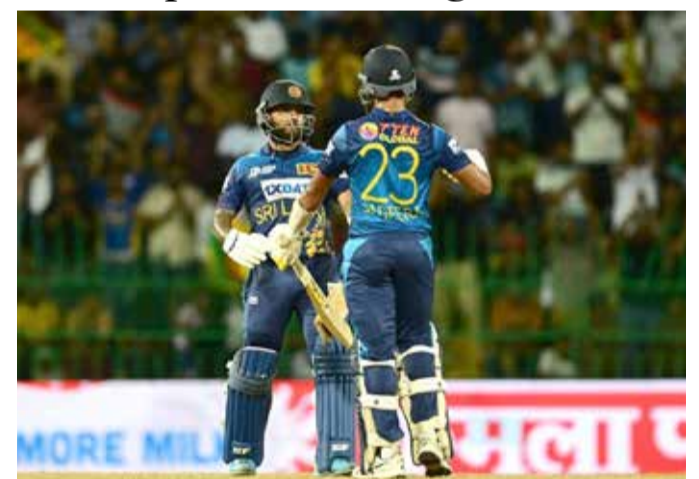
Sri Lanka's Kusal Mendis (L) celebrates after scoring a half-century (50 runs) with Sri Lanka's Sadeera Samarawickrama