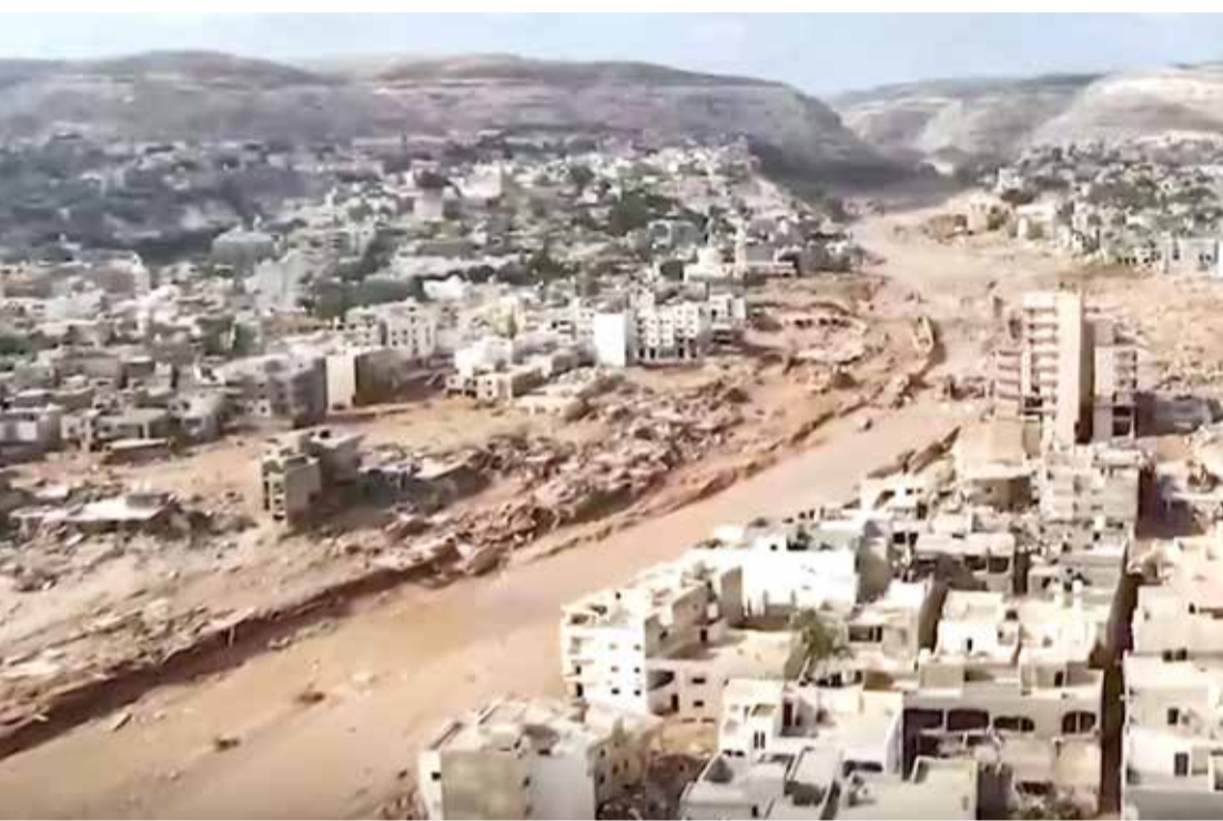
This image grab from footage published on social networks by Libyan al-Masara television channel on September 13 shows an aerial view of floods after the Mediterranean storm "Daniel" hit Libya's eastern city of Derna.