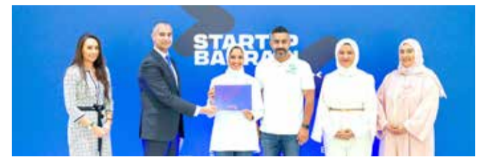
During a presentation ceremony